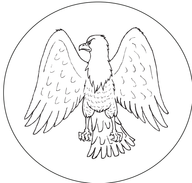
Coin #2, front and back