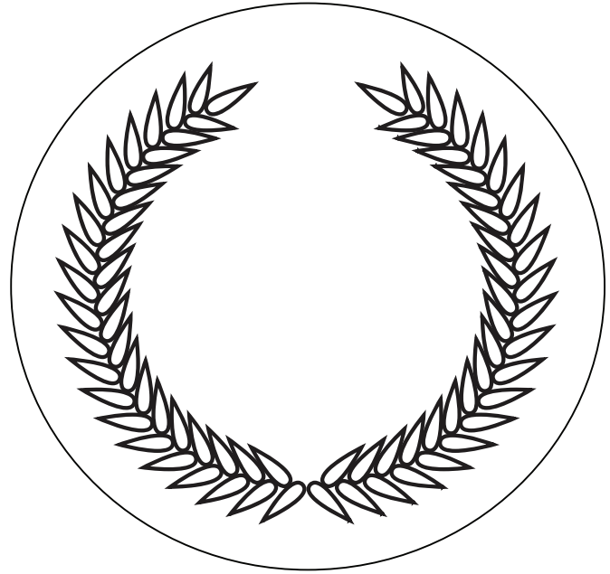
Coin #3, front and back