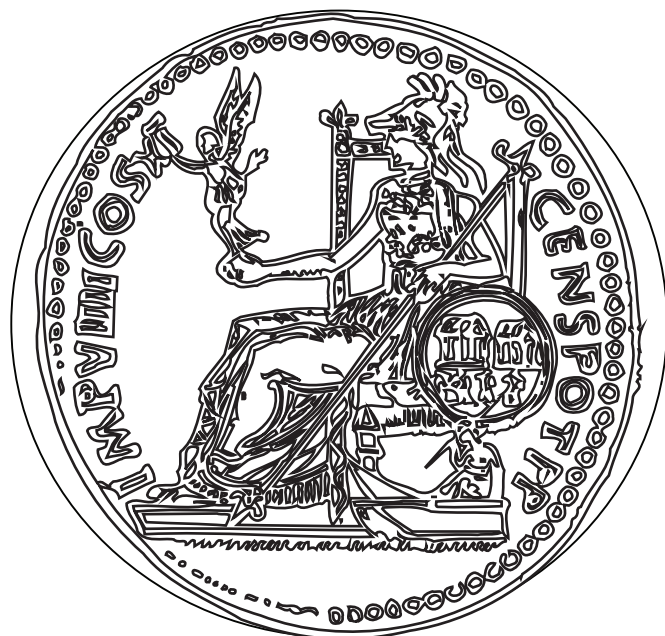
Coin #1, front and back