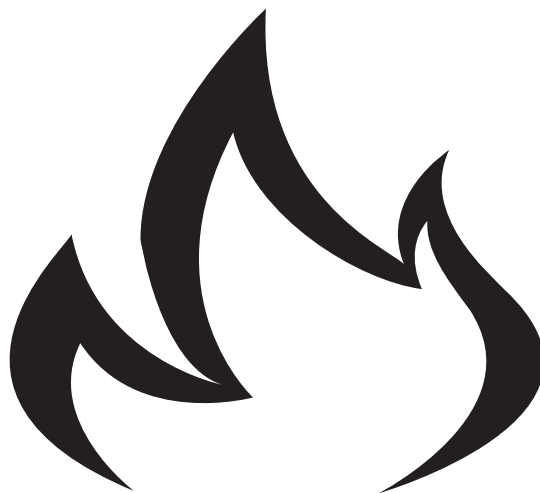
Template #3 Orange Flame